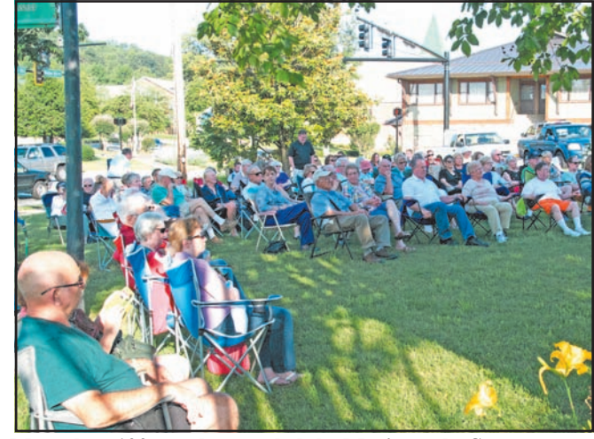
More than 100 people attended the Music on the Square event in town on Saturday, June 10.