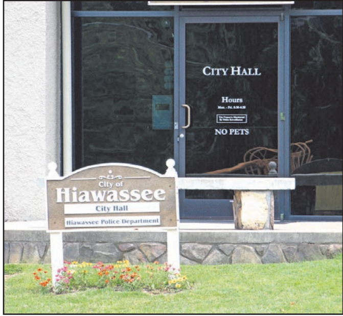
Hiawassee City Hall

According to the project announcement, which came to the Towns County Herald from U.S. Rep. Doug Collins' office: